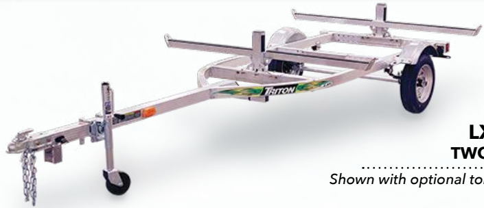
LXT-LK2 TWO PLACE