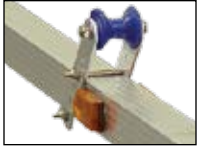
Optional roller kit for hull support. 12115