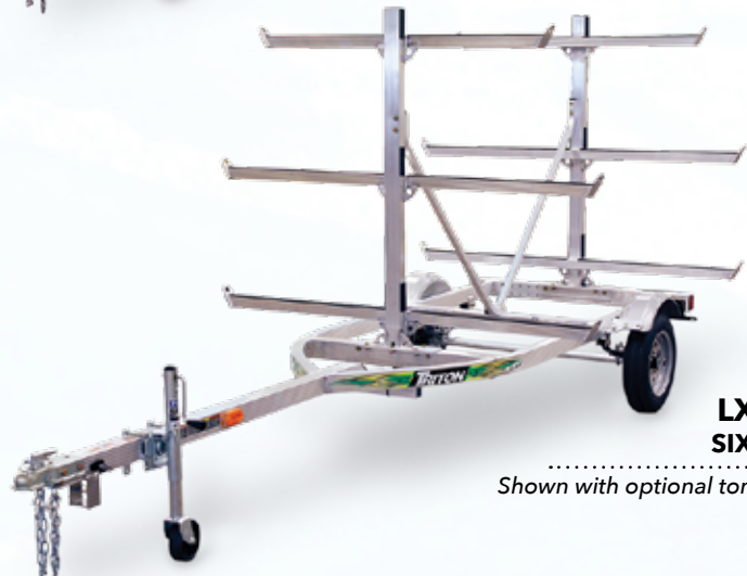
LXT-LK6 SIX PLACE