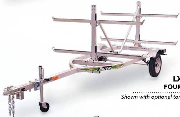
LXT-LK4 FOUR PLACE